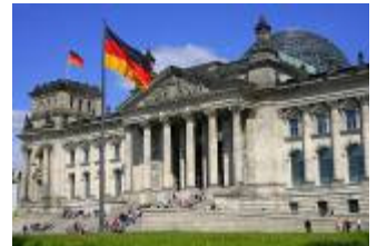
Berlin - The Reichstag