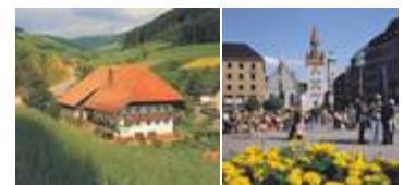
Black Forest House