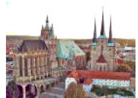
Erfurt: Cathedral and St. Severin