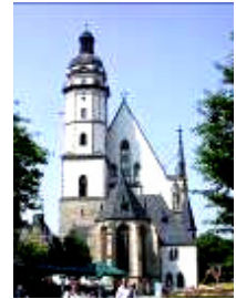
Leipzig: Thomas church