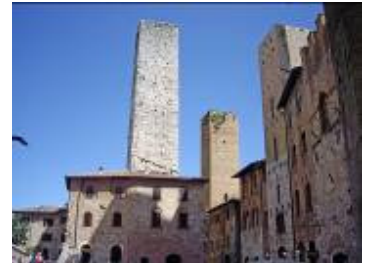
San Gimignano Towers