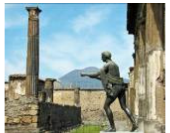
Pompeii: Apollo Temple

This excursion is dedicated to wonderful Pompeii – a Roman city destroyed and yet preserved by a volcanic eruption in 79 a.D. Afterwards you will drive along the Bay of Naples to romantic Sorrento before returning to Rome Dinner (en route) and overnight in Rome