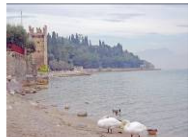
Sirmione on Lake Garda